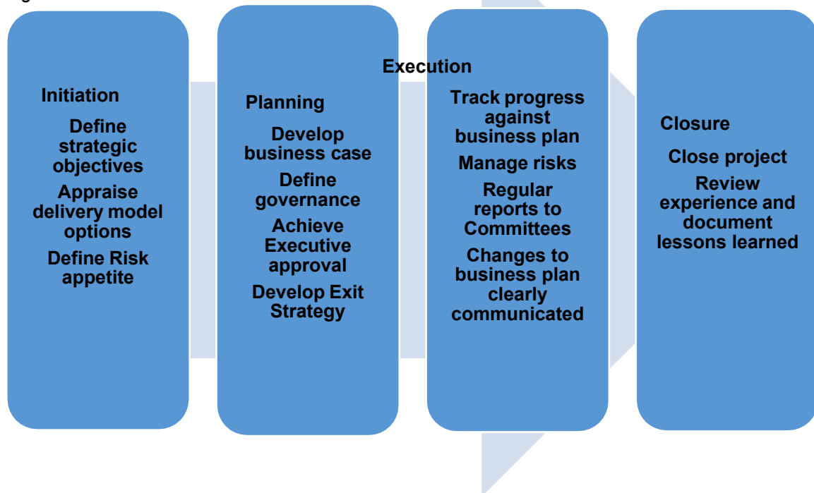
Figure 1: Framework overview